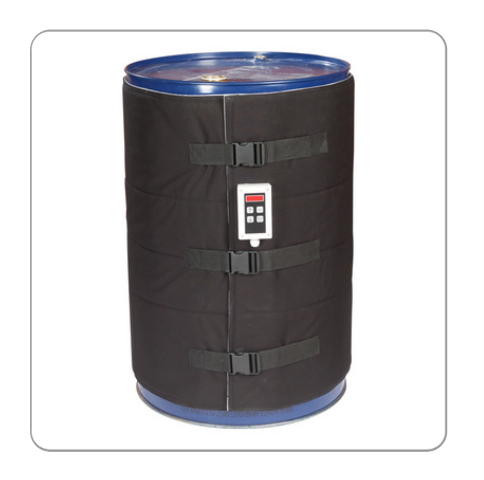
DRUM HEATERS 0 - 90°C

The drum heaters are designed in a durable and long lasting high quality lightweight design and the construction together with quick release webbing straps makes the drum heater easy to attach to any standard size drum.