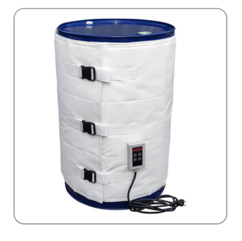
DRUM HEATERS FOR FOODSTUFF

Equipped with an easy to use thermostat with a heating range from 0 - 200°C makes this drum heater ideal for almost any purpose (the maximum temperature can vary due to the maximum temperature of liquids).