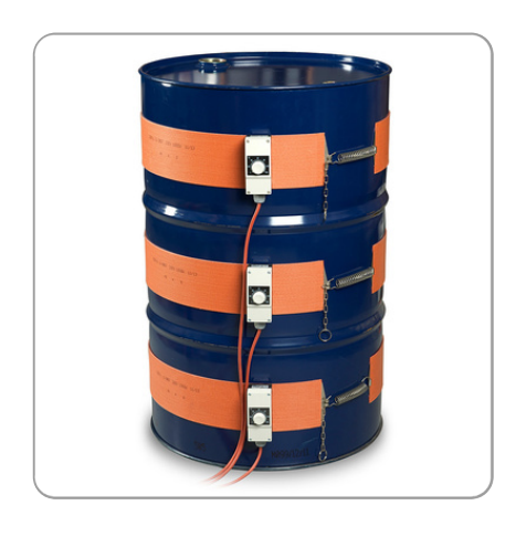
SILICONE DRUM HEATERS

With this drum heater it is easy, fast and absolutely safe within regulations to heat up fluids to a desired temperature - all the way to 120°C of course depending on the fluids maximum temperature.