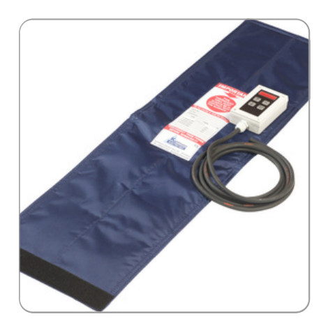
ULTRAHEAT HEATING BLANKETS 0-90°C

Industrial heating high temperature blankets are produced with a controllable Jumo thermostat box.