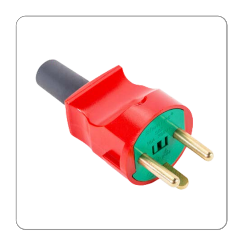
PLUG AND FASTENING VARIATIONS

Industrial heating high temperature blankets are produced with an adjustable temperature controller