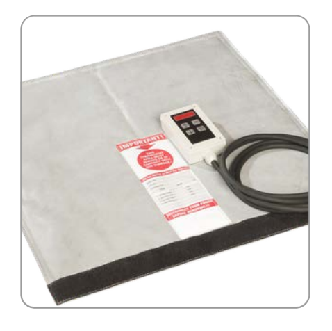
ULTRAHEAT HEATING BLANKETS 0-120°C

Granudan heating blankets are available in many standard sizes with different output.