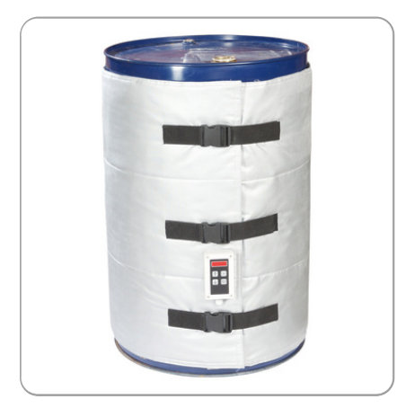
DRUM HEATERS 0 - 200°C

Equipped with an easy to use thermostat with a heating range from 0 - 40°C or 0 - 90°C makes this drum heater ideal for almost any purpose.